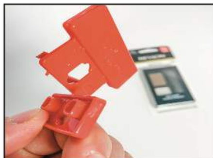
2. Twist the bottom piece to detach