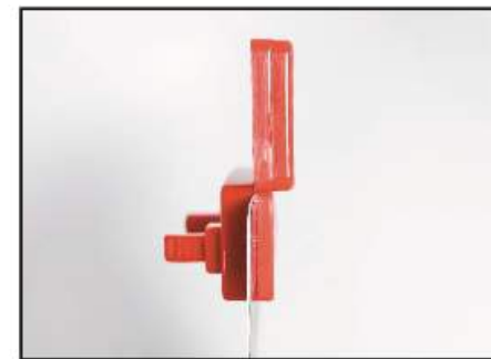
7. Product is secure and ready for display