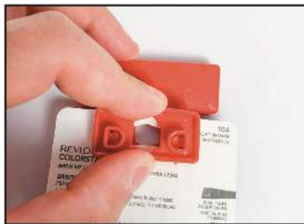
6. Press down until tight on merchandise (If unable to tighten, the back piece is oriented the wrong way)