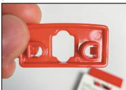
4. Take the bottom piece, with the flat face facing down & the curved edge of the piece pointing up