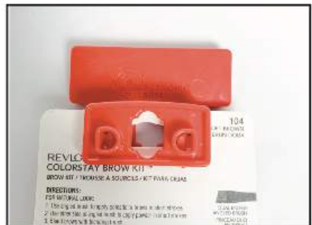
5. Place on to pegs