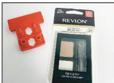
1. Take disposable tag