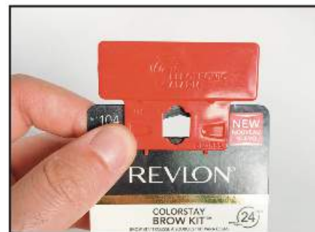
3. Put pegs of top piece through front of merchandise hang hole